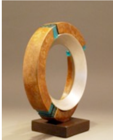
"Off Centered Circles", Frank Morbillo