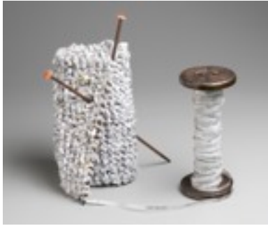
"Security Blanket" Georgia Zwartjes