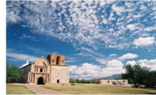
The grounds of the Tumacácori Mission are beautiful at all times of the year.

More than just adobe, plaster, and wood, these ruins evoke tales of life and land transformed by cultures meeting and mixing. Father Kino's 1691 landmark visit to an O'odham village when he established Mission Tumacácori was just one event among many.